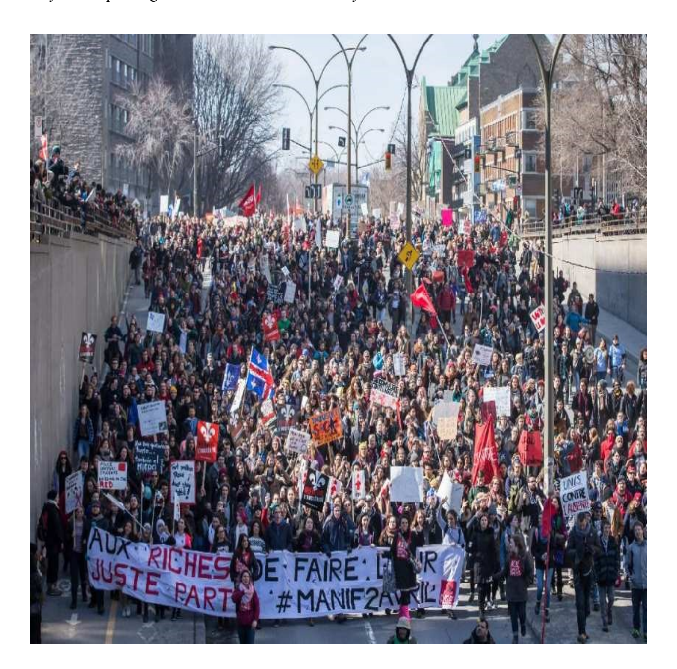
An anti-austerity demonstration in Montreal on Thursday, April 2, 2015.

The Ontario Court of Appeal reversed the decision of Justice Myers of the Superior Court of Justice. The appeal decision is a blueprint for the rights of protesters in these circumstances. The decision is a model of brevity and clarity. It deals with common-law police powers, freedom of expression, common-law liberty, and the relationship between performance of a duty for the public good and one's individual liberty.