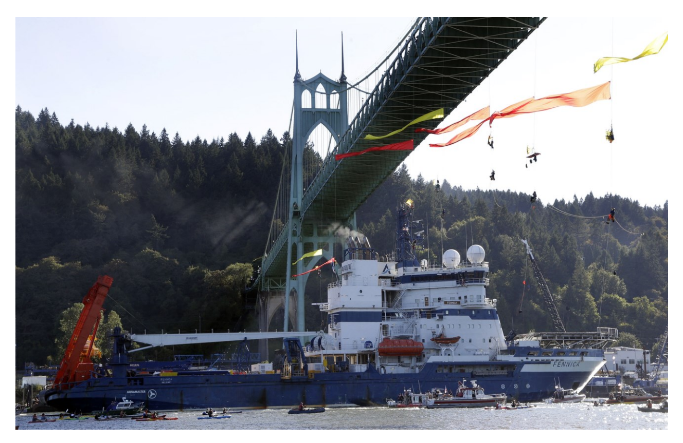
Greenpeace Protesters use Kayaks to encircle Greenpeace Activists Hanging from St. John's Bridge over the Williamette River, Portland, Oregon, to protest the departure of the Shell icebreaker Fennica en route to Alaska for Arctic Drilling, July 30, 2015.

Masters also have limited authority to lawfully detain, put people under custody, and even use force in in order to ensure the safety of a vessel and passengers. This is a power that can potentially be used against protesters who endanger vessels.