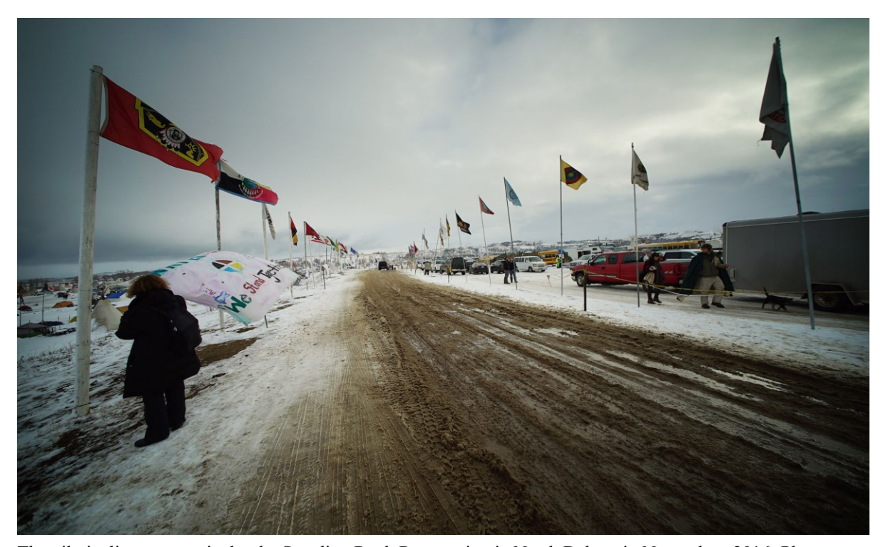
The oil pipeline protest site by the Standing Rock Reservation in North Dakota in November, 2016; Photos by Cory Lum of the Honolulu Civil Beat

On November 20, 2016 at a standoff near the Standing Rock encampment that lasted for more than six hours, police sprayed a crowd of roughly 400 protesters with water in temperatures hovering below freezing (photo below). Camp medics reported that hundreds were treated for hypothermia. Twenty-six people were hospitalized. National Lawyers Guild observers reported that several people were unconscious and bleeding after being shot by rubber bullets.