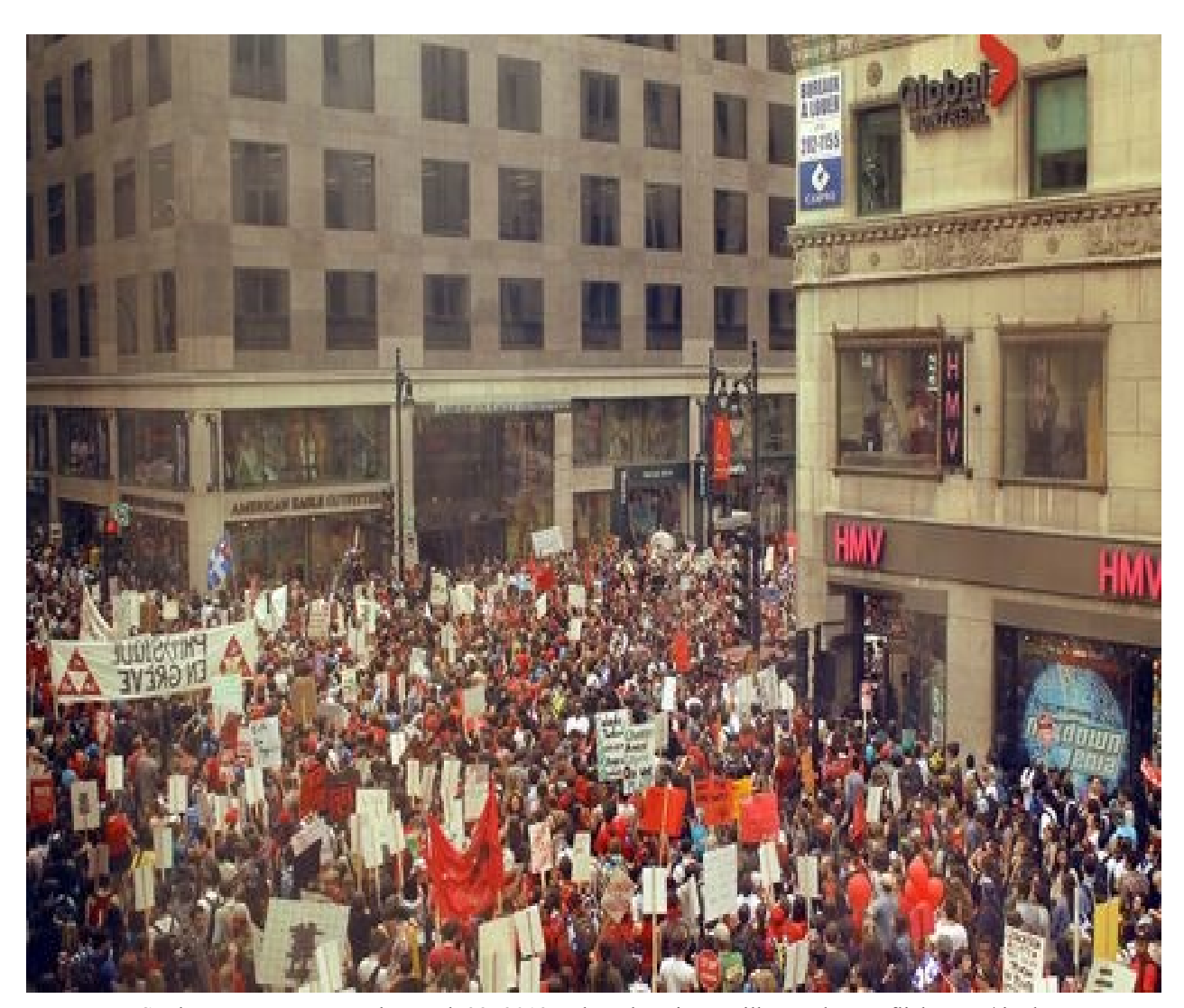
Student protest, Montreal, March 22, 2012.

The detention must be conducted in a reasonable manner. Investigative detention should be brief. There is no obligation on the detained person to answer questions.