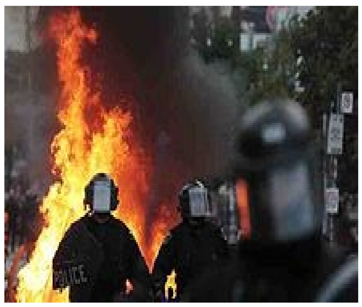
G-20 Bloc/police provoked riot – police in front of burning police vehicle, Toronto, June 26-27, 2010

This was the conduct engaged in and filmed in the G20 demonstration, which had been peaceful. A small number of black clad protesters – perhaps 100 – separated from the crowd and began torching police cars and then smashing windows. Then they removed their black outer clothing and blended in with the crowd of peaceful protesters. Some speculated that, as in the Montebello illustration, these violent demonstrators where agent provocateurs whose task it was to discredit the peaceful protesters and their objectives. The filmmaker – Joe Wenkoff - speculated that it was odd considering the 1.5 billion dollars spent on security, and the presence of approximately 20,000 police officers in the general area of the demonstration, that there wasn't a single police officer within blocks of the violence, which took place in one of the prime business areas in downtown Toronto and an area easily anticipated to be a magnet for this kind of violent demonstrator.