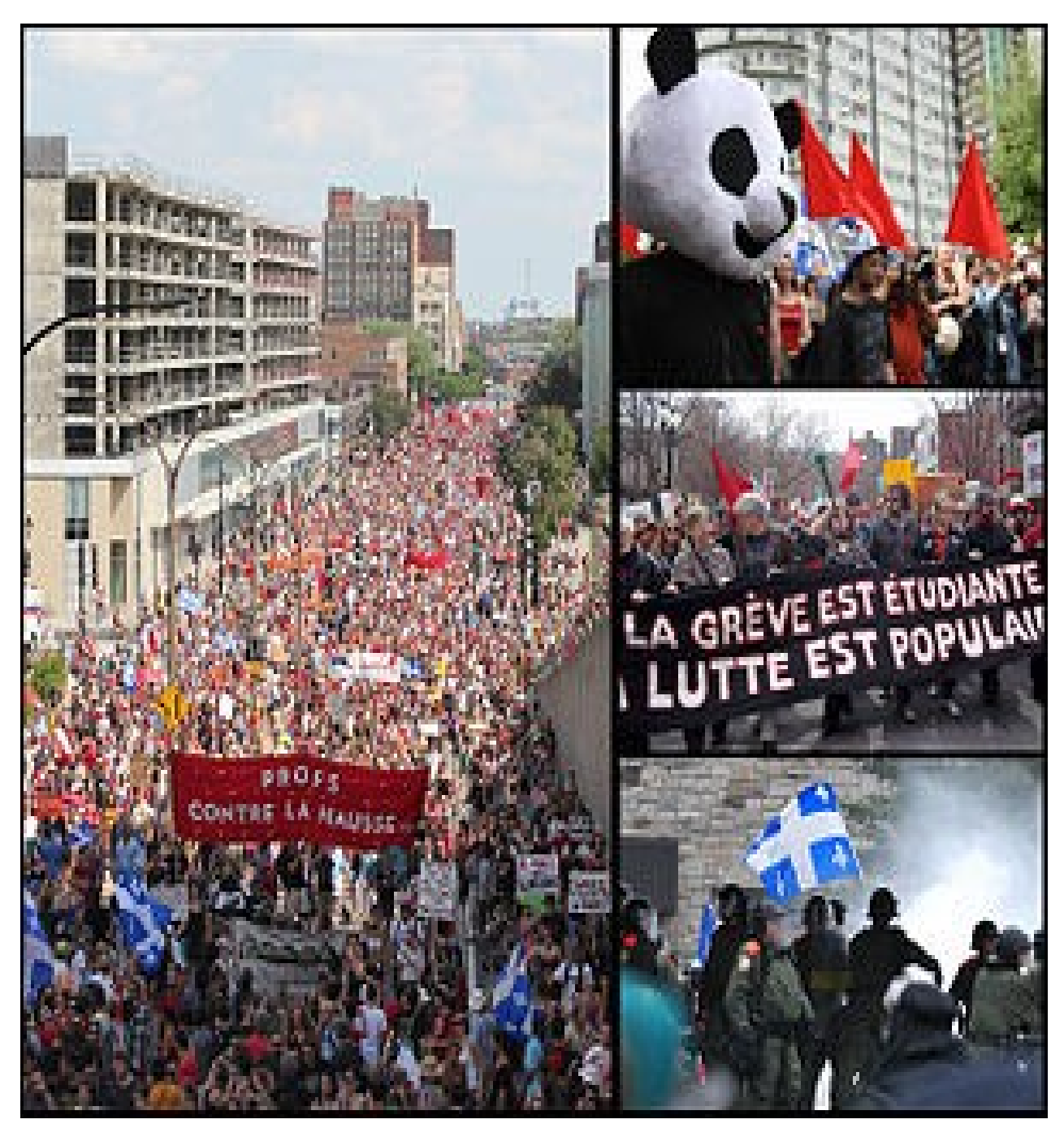
Québec Student Protests 2012