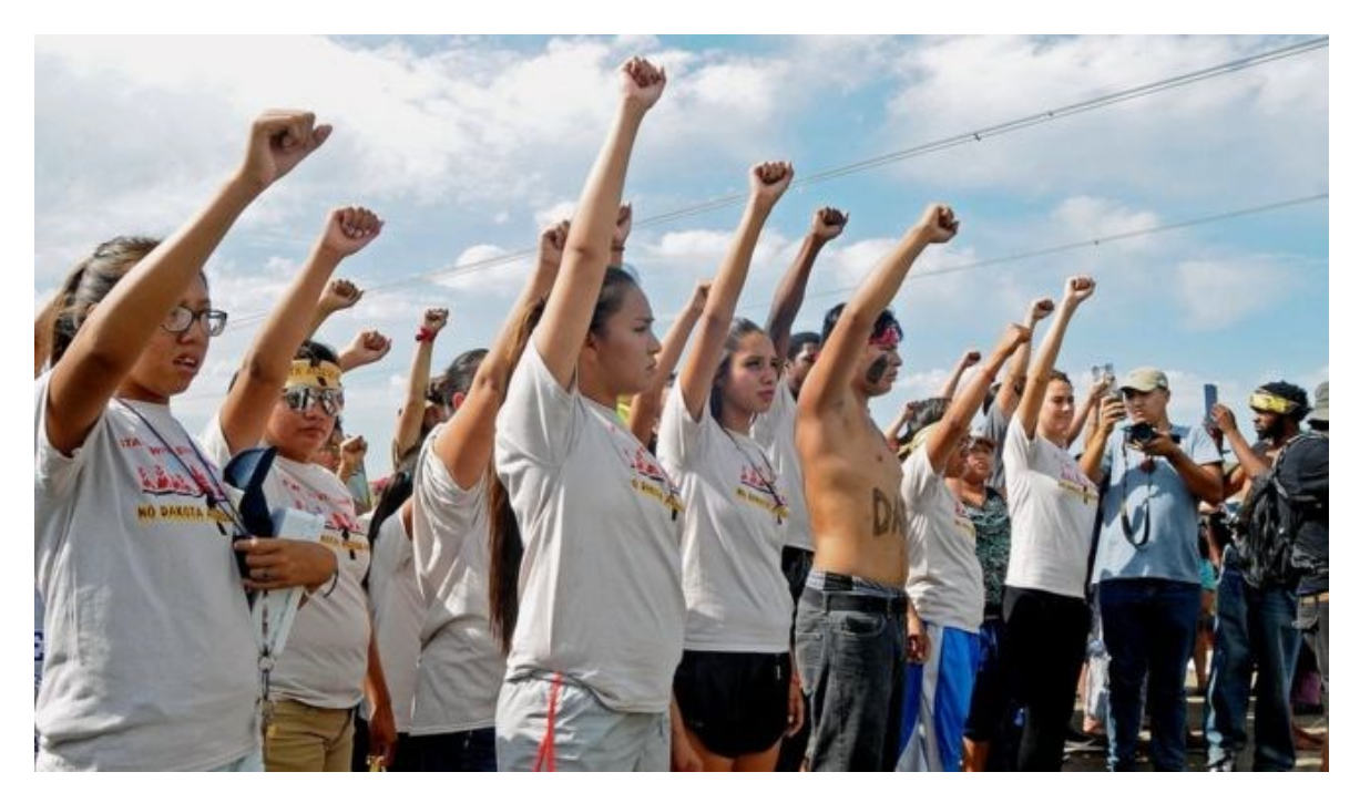
A group of Native American protesters halt work on the Dakota Access Pipe line North Dakota on August 16, 2016.

Many expressed the view that the legislation violated freedoms of expression, association and conscience. Its passage prompted even larger and more sustained demonstrations including a protest of over 100,000 people in Montréal on May 22, 2013.