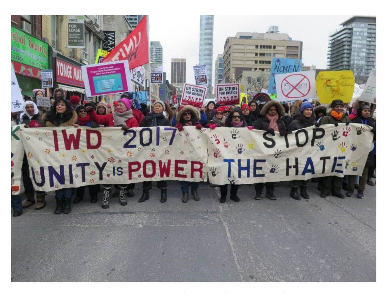
Women's Day Protest, Toronto, March 11, 2017