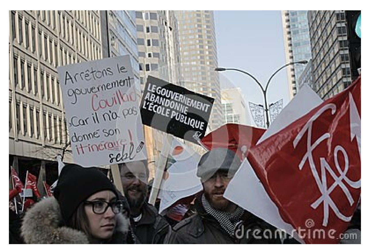
Montreal, Québec, Canada, 9 December 2015: Public-sector workers protest in Montreal - members of Common Front unions, including teachers and health care professionals.