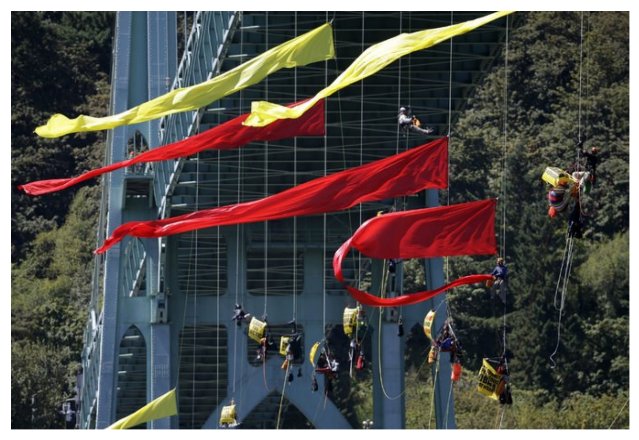
Greenpeace Activists Hanging from St. John's Bridge over the Williamette River, Portland, Oregon, to protest the departure of the Shell icebreaker Fennica en route to Alaska for Arctic Drilling, July 30, 2015