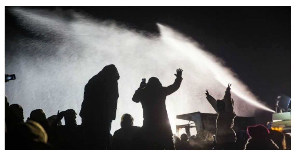
Fire hoses deployed on water protectors at the Dakota Access Pipeline protest.

On November 20, 2016 at a standoff near the Standing Rock encampment that lasted for more than six hours, police sprayed a crowd of roughly 400 protesters with water in temperatures hovering below freezing (photo below). Camp medics reported that hundreds were treated for hypothermia. Twenty-six people were hospitalized. National Lawyers Guild observers reported that several people were unconscious and bleeding after being shot by rubber bullets.