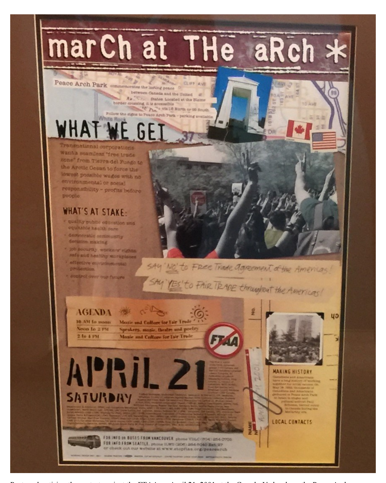
Poster advertising the protest against the FTAA on April 21, 2001 at the Canada-Us border – the Peace Arch.