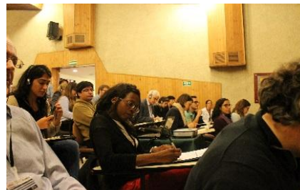
INNCA University hosted the opening ceremony including talks by prominent human rights defenders and a display of Colombian traditional dances