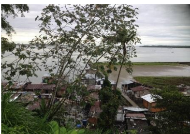
Local fishing villages resist displacement

The Caravana visited the Puente Nayero Humanitarian Space, created by a local fishing community as an attempt to keep out armed paramilitary groups which continue to operate throughout the city despite heavy militarisation by the State. The Caravana is concerned about how the international community can guarantee that the proposed expansion of the port for international trade will not contribute to the displacement of these fishing communities and the loss of their traditional ways of life.