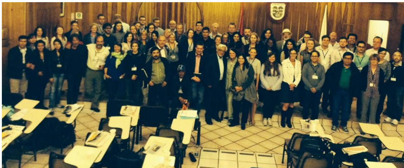
IV International Caravan of Jurists - delegates 2014

Colombian Caravana UK Lawyers' Group - October 2014