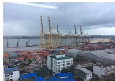
There are plans to expand the port.

The Caravana notes that on 15 September the Humanitarian Space was granted precautionary protection measures by the Inter American Commission on Human Rights. It is important that the international community urges the Colombian State to implement these measures. Urgent international support is also needed for the work of other human rights defenders and the Human Rights Ombudsman's Office in the city.