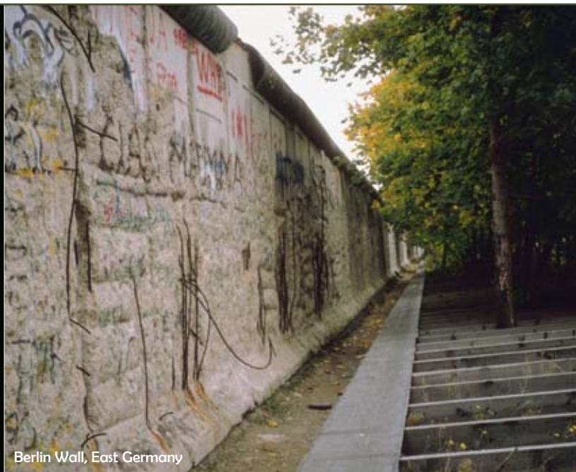
Berlin Wall, East Germany