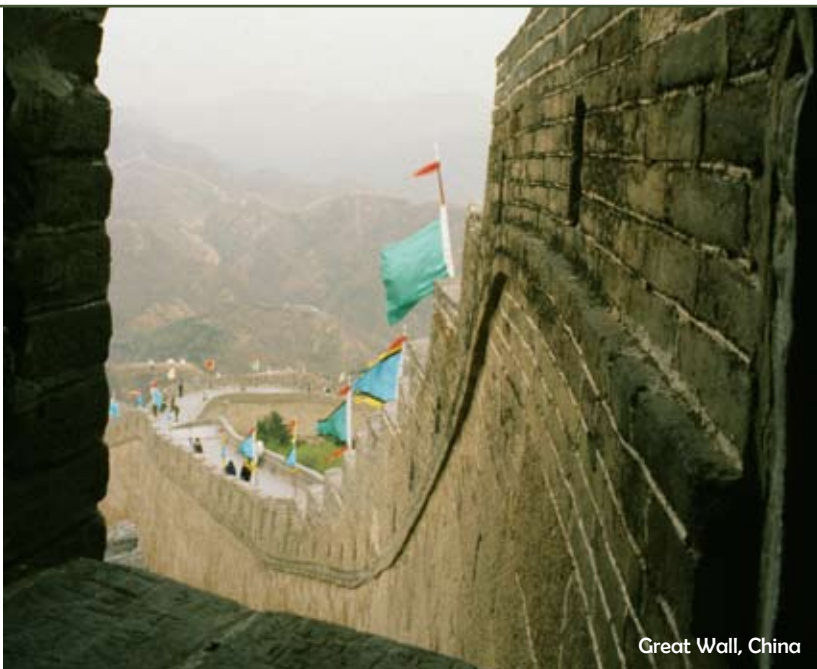
Great Wall, China

One of the cardinal tenets of China According to Resnick is that the Chinese “judiciary” is completely independent from control by the Chinese Communist Party/Government, because Article 126 of the Chinese Constitution says so.