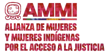
Alianza de Mujeres y Mujeres Indígenas por el Acceso a la Justicia