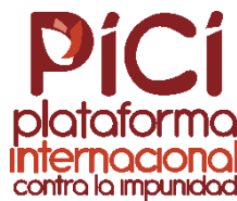
Plataforma Internacional contra la Impunidad