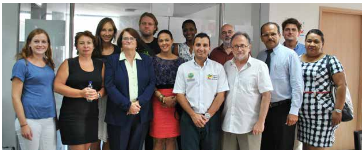
Delegates in Cartagena

The Caravana is concerned about this stigmatisation against one of the community members. It is also worrying that, according to information we received, the threats against them may not have been taken seriously.