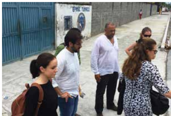
Delegates wait to gain entry to the prison in Tumaco

The detainees fear that they face continued and prolonged preventative detention as they await trial. One of the detainees had a hearing scheduled for 30 August 2016, but was not hopeful and suspected that an adjournment was the most likely outcome.