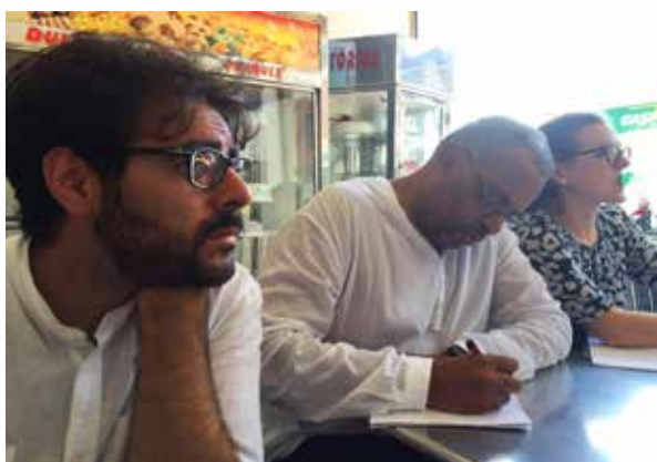
Caravanistas hear from victims and defenders, Tumaco

Memory (NCHM) were created to implement these programs. The NCHM describes its purpose “to contribute to the comprehensive reparation and to the right to the truth for the victims of the Colombian armed conflict as well as society in general”.