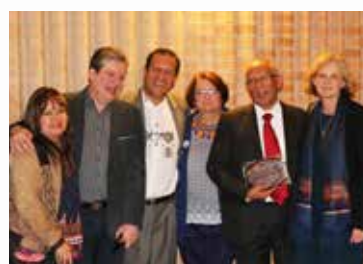
Members of the Ccajar Lawyers' Collective and the Caravana delegation