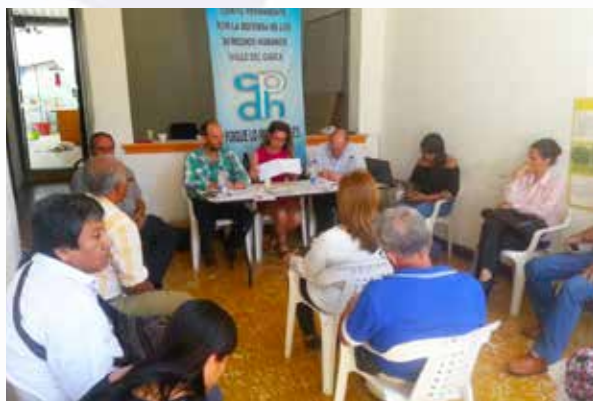
Caravana regional group with lawyers and defenders in Cali