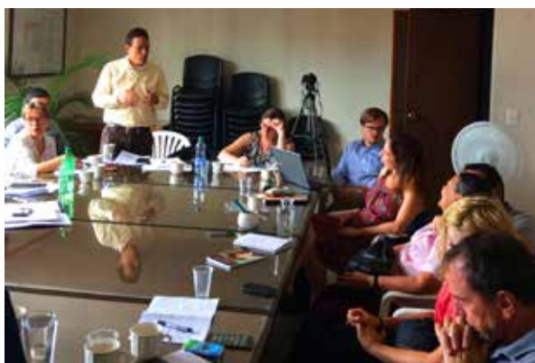
Delegates hear testimony from lawyers and defenders, Medellín

Although the first excavation efforts have not found anything so far, the Mayor's office is providing financial support for the excavations and the Public Prosecutor is providing technical support. A multi-disciplinary group of lawyers and other professionals such as psychologists and anthropologists are working on the development of a plan to find the "disappeared" from Comuna 13.