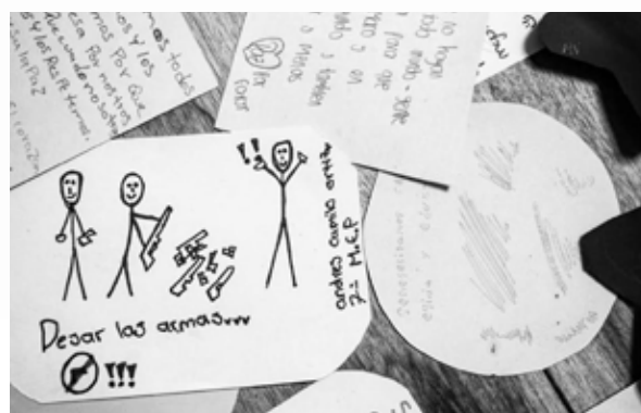
Workshop with messages for peace and social justice, Tumaco

Given that non-repetition entails a cultural and institutional commitment to move beyond violence and human rights abuses, it inevitably carries with it a connotation of rehabilitation. Genuine social, political and cultural transformation in Colombia will involve a shift towards the acknowledgment of the deep socio-economic divisions and disadvantages that continue to fuel conflict. Some of the Caravana’s partners have strongly argued for the need for not only the strengthening of State institutions for investigation and protection, but also for the transformation of economic and legal structures, including the economic or development model that underpins government policies. The IACHR has also emphasised the importance of addressing structural and systemic sources of violence and human rights violations, including the very challenging problem of how to comprehensively dismantle the paramilitaries or neo-paramilitaries through the effective investigation and sanction of their political and economic sponsors. In this way non-repetition can be interpreted as part of a wider rehabilitation of the State structures to ensure a lasting peace. For more discussion of non-repetition, see also page 27)