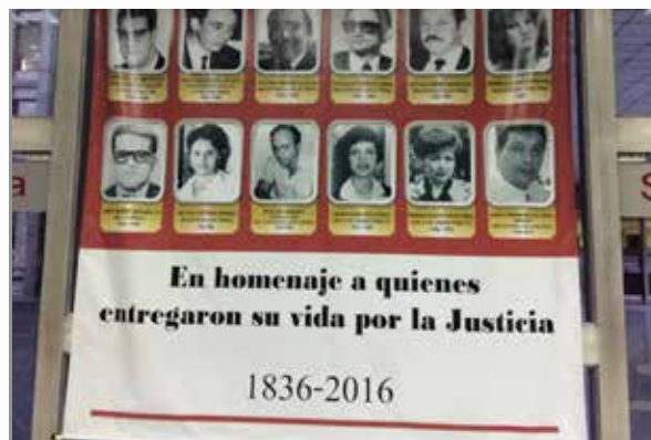
Placard showing lawyers and judges killed for carrying out their profession, Medellín

We received testimony on the transitional justice model in the Peace Agreement signed between the Colombian government and the FARC- EP, including some concerns, but also the hope that it would help to address long-standing impunity and injustice associated with the ordinary justice system. However, human rights and victims’ organisations made clear that numerous violations have been perpetrated and continue to be committed outside of the conflict, including targeted abuses against human rights defenders. Many of these acts are perpetrated by actors that are not included within the peace agreement, to whom the ordinary justice system applies. In particular, we heard concerns about on-going abuses by new paramilitary groups.