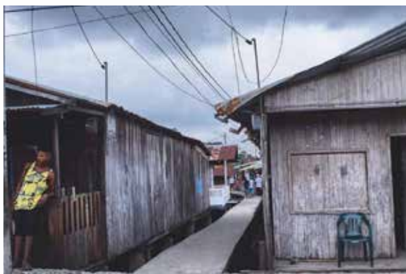
Tumaco, department of Nariño