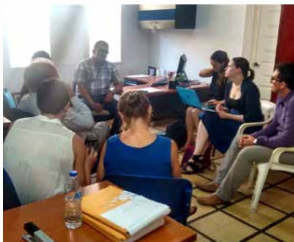
Caravana delegates in meeting with the Colombian authorities, Barranquilla

Some of the victims we met raised concerns about how the transitional justice proposals in the peace process would be implemented because of fears that perpetrators would go free and they would lose their chance of obtaining justice. The Peace Agreement provides that military commanders cannot be found responsible for the crimes of their subordinates solely because of their rank. Rather, their responsibility will need to be proven based on their effective control and knowledge of the act, and the measures they took to prevent it and promote its investigation. There are concerns this could lead to a different interpretation of Command Responsibility than that used under international law, where military commanders are criminally responsible for the acts of their subordinates and thus make it more difficult to bring high ranking members of the military to justice. 53