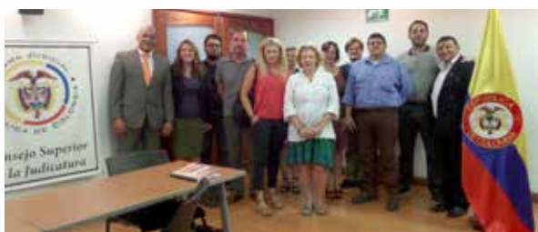
Caravana delegates with the Superior Judicial Council, Medellín

During the prison visits, delegates were able to interview prisoners who were members of either the FARC-EP or the ELN and identified two principal trends in relation to their legal cases. Firstly, there were numerous cases of alleged guerrillas held on remand for years pre-trial. Secondly, a significant proportion of guerrilla prisoners claimed that they had been tried in absentia. The Caravana is aware that under Colombian law this is permitted in certain cases, so long as it is shown that reasonable steps have been taken to locate the accused and ensure their presence. However, the cases reported included members of guerrilla groups who were tried and sentenced in absentia, when they were already imprisoned in Colombian jails. 45