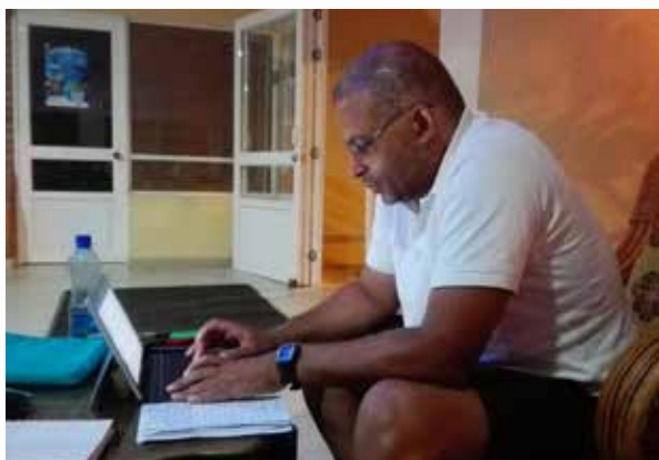
Caravanistas writing up information in Tumaco

In researching this report, Caravana members conducted meetings and interviews with human rights lawyers, NGOs, social movements, victims, community leaders, international organisations, diplomatic missions, and the Colombian authorities. These meetings took place during a week in August in seven regional centres of Colombia (Medellín, Cúcuta, Barranquilla, Bucaramanga, Cartagena, Tumaco and Cali) as well as in the capital city, Bogotá. The meetings were organised and arranged in conjunction with local lawyers and human rights organisations. We were fortunate to hear from so many prominent experts and lawyers, especially in Colombia, and are particularly grateful to the UN office OHCHR for their detailed briefing. We acknowledge the input of the Colombian embassy in London in organizing high-level meetings with Colombian authorities, and to the State authorities at a local and national level for maintaining an open door to respond to our questions.