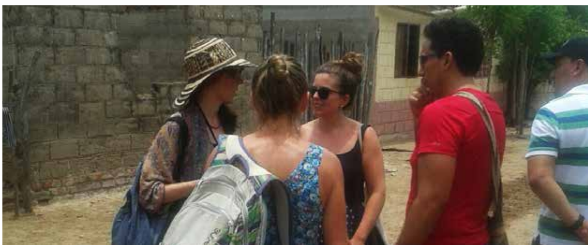
Caravana Barranquilla group speak with Santa Rita community members

There was a real sense of lost hope in the community as well as distrust; it was a very clear example of where the system had failed to provide any meaningful assistance, and the community was clearly frustrated especially with the failure to enforce the judgment and the lack of any concrete change. The community also voiced its frustration with the way that the law did not differentiate between the levels of victimhood that had been suffered.