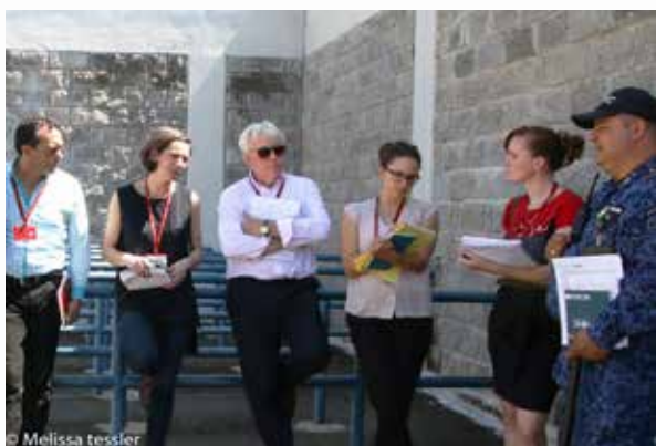
Caravana delegates speak to authorities in Palogordo prison, Bucaramanga

A core feature of the commitment to the guarantees of non-repetition of grave human rights abuses is changes to society that must accompany the recognition of authentic truth, justice and reparations within the framework of long term peace. An issue which was repeatedly emphasised, both in discussions in the regions and amongst the Caravana delegation, was that transitional justice must encompass the rehabilitation of State institutions and practices. What is meant by this is that for the State to become the guarantor of long-term peace and the respect for fundamental human rights, it must itself undergo transformation and rehabilitation. To this extent, it seems to us that the issue of prison conditions was highly symbolic. The prison as a site for rehabilitation, as well as punishment, takes on an important role in hopes of building new lives and beginnings after periods of violence; however, prisons are all too often neglected and abandoned places by the State. The Cali regional delegation obtained access to Jamundi prison and was able to witness the nature of prison conditions inside. What emerges from the visit are the deep-seated problems and concerns about prison conditions and the concerns about the urgent need for prison reform.