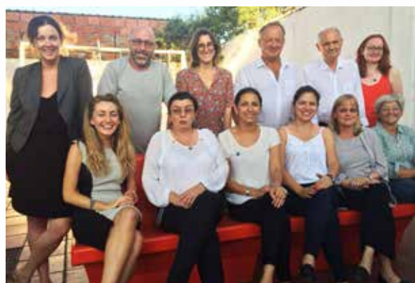
Caravana regional group and the Colectivo de Abogados Luis Carlos Pérez (CCALCP), Cúcuta

Since 2005, CCALCP and its members have experienced, at least 40 serious security incidents ranging from physical aggression, attacks, threats, harassment, surveillance, thefts, defamation and attacks on the Collective’s infrastructure. The Collective has reported these incidents to the authorities, both formally and publicly including the Attorney General’s Office. Not a single concrete result has flowed from these complaints. Certain complaints such as being followed and harassment have been met with the discriminatory response that the women had been pursued by admirers or spurned boyfriends.