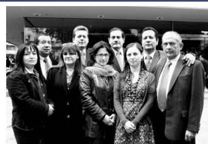
Corporación Colectivo de Abogados José Alvear Restrepo

The amicus curiae submissions of LRWC and Lawyers Without Borders Canada (LWBC) were filed with the IACHR on April 12, 2013. The joint amicus examines Colombia's duty as a member of the Organization of American States and a party to the American Convention on Human Rights to prevent and punish attacks on lawyers as part of state legal obligations to ensure the advocacy and personal rights of clients and lawyers. The amicus was filed in English and Spanish. The petition, Members of José Alvéar Restrepo Lawyers' Collective v. Colombia , Case No. 12.380, will be heard at a date yet to be determined.