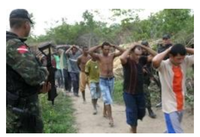
Photo 2: Today, Rondonia is a totally militarized region.

The present Brazilian government has kept the former government's policies inoperative regarding agrarian reform