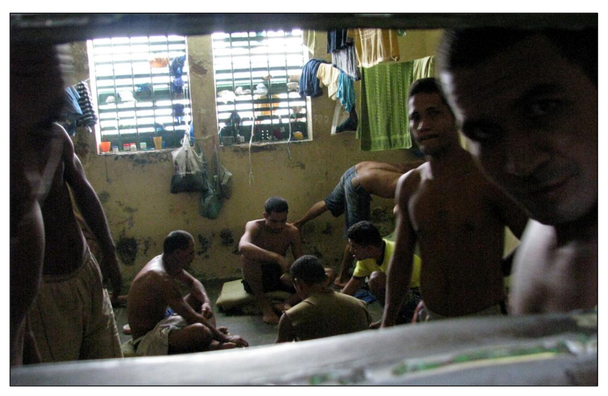
Photo 6: The prison facility does not fully provide basic human conditions to the prisoners.

The prison facility does not fully provide basic human conditions to the prisoners. The actual state of the cells causes an inhuman treatment of the prisoners which forms again not only a violation of the aforementioned instruments but also the right to the protection of one's honor as contemplated in article V of the American Declaration of the Rights and Duties of Man. The delegation also explicitly refers to the Standard Minimum Rules for the