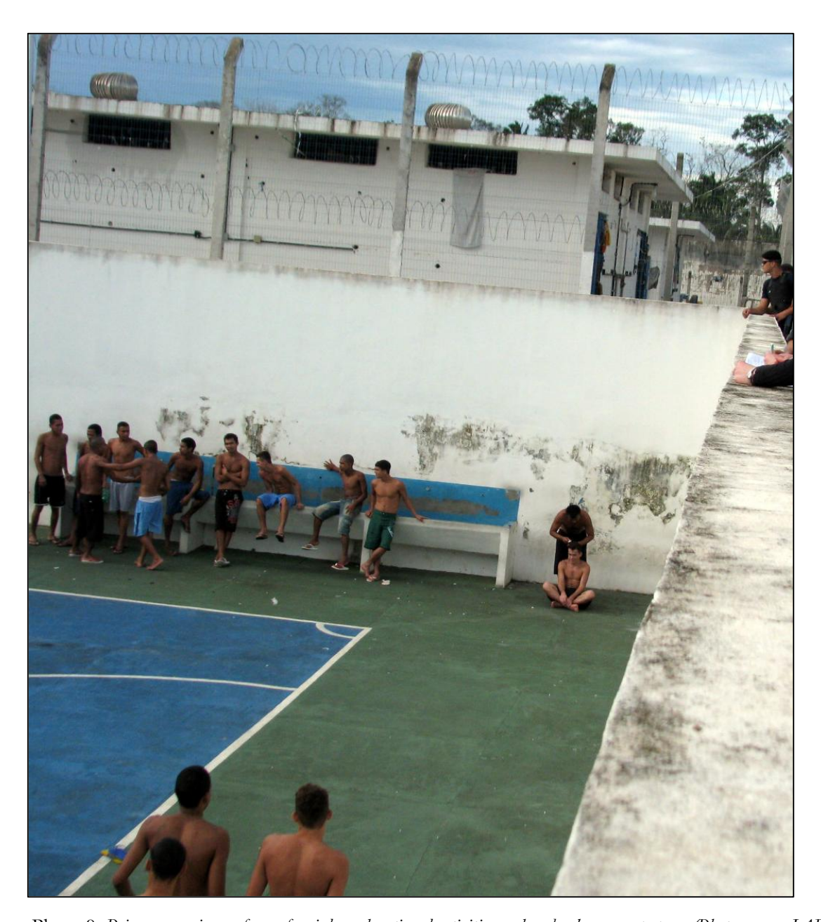
Photo 9: Prisoners receive no form of social or educational activities and no book or newspaper.