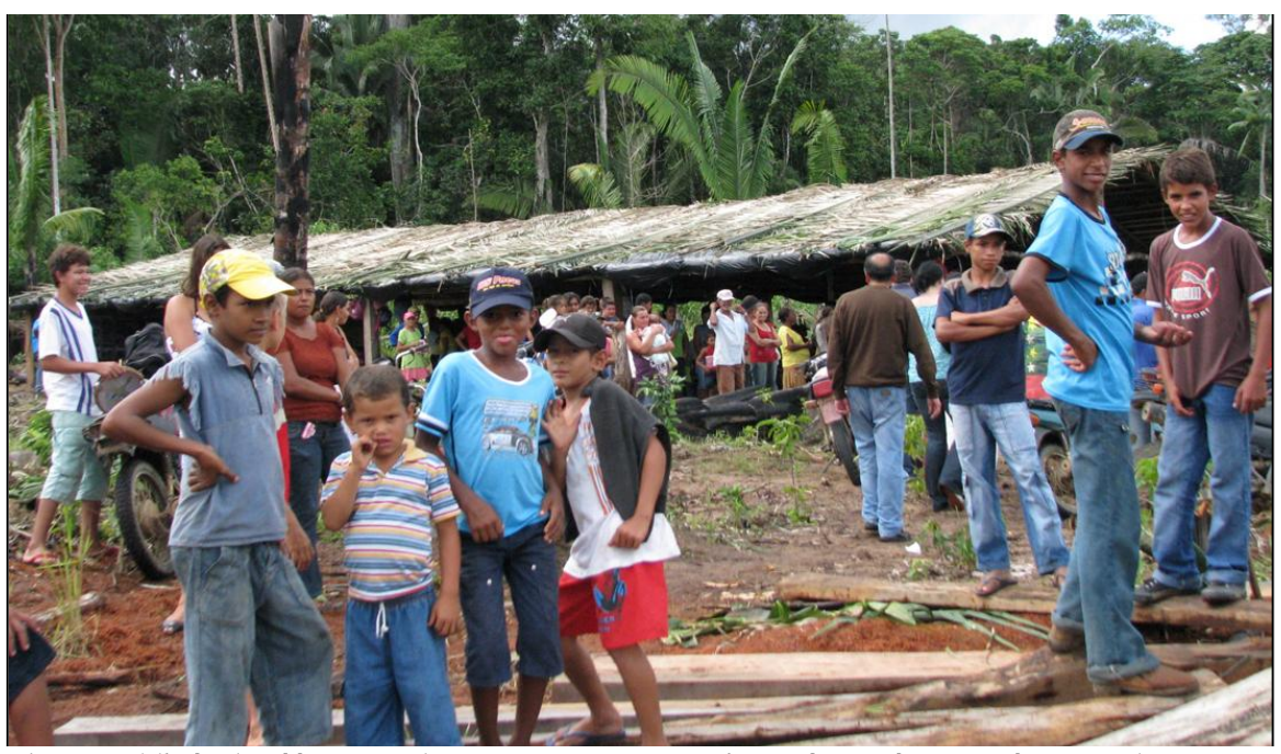
Photo 12: The land problem in Rondonia state is a major source for social inequality, unemployment and poverty.

While the Brazilian government does not appear to have taken any decisive action to resolve the tremendous problem of lack of land for the poor people, the IAPL Fact Finding Mission confirms that there are credible reports and indications that the State oppresses those that struggle for the basic right to the possession and use of land. Indeed, the land problem in Rondonia state is a major source for social inequality, unemployment and poverty.