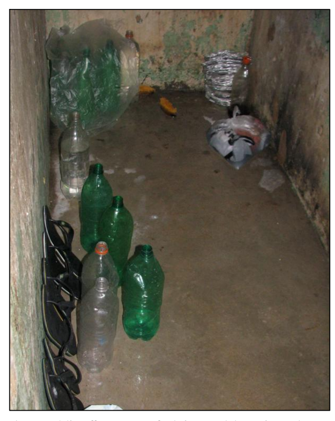
Photo 7: The cells are in very bad shape and do not have adequate hygienic provisions.

Prisoners also made complaints about the quantity and quality of the food provided to them. There was not enough food and it would be of a very bad quality. This is confirmed in the order of the Inter-American Court that states: "that water supply is poor, so many suffer from dehydration, and it is of extremely bad quality, just as the food" "1"