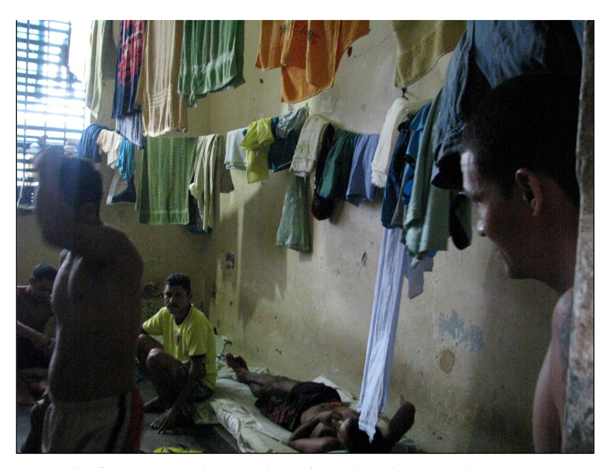
Photo 8: The cells are overcrowded, where inmates have to alternate the use of mattresses.

This lack of a proper hygiene results in a deficient state of health of the prisoners. The delegation has been told that serious health problems occur, like malaria, meniscus and even scorbutic illness. Prisoners do not get proper medical treatment since there is no permanent medical service.