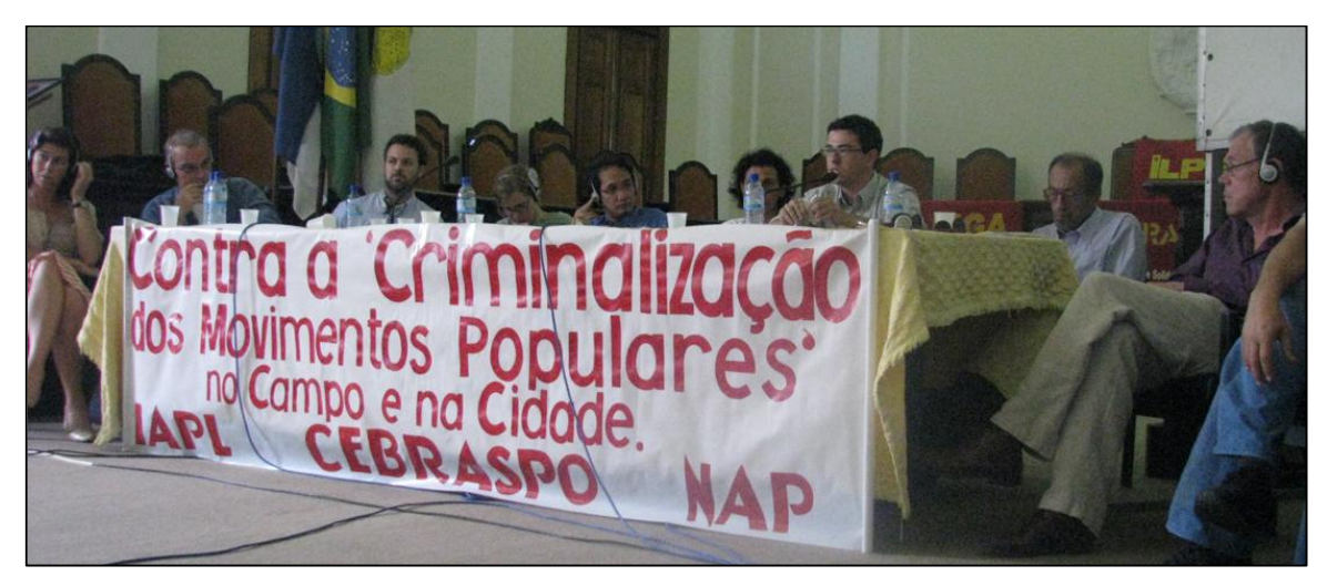
Photo 13: IAPL stands in firm solidarity with its colleagues who side with the masses of poor peasants.

The IAPL Fact Finding Mission at the same time salutes the tireless people's lawyers in Rondonia and in other parts of Brazil who continue to defend and represent the poor peasants against the onslaughts of the latifundium system and against the violations of their rights. It stands in firm solidarity with its colleagues who side with the larger majority of the people.