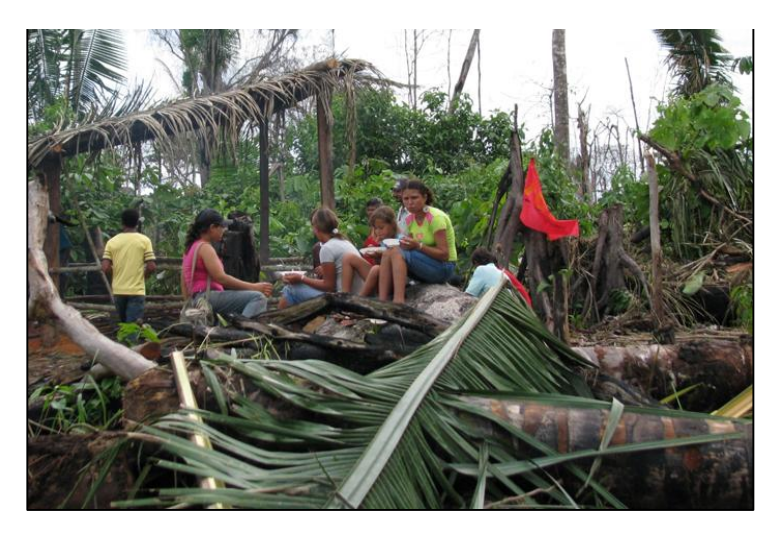
Photo 1: The level of poverty and inequality is striking in Rondonia.

And with the development of the peasant fight for land and for the democratization of landownership by the organized farmers, State repression has heightened.