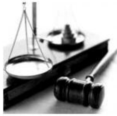
Law Commission of Canada