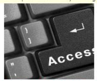
Access to Information