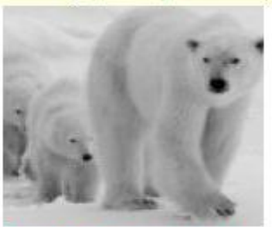
Canadian Foundation for Climate and Atmospheric Sciences