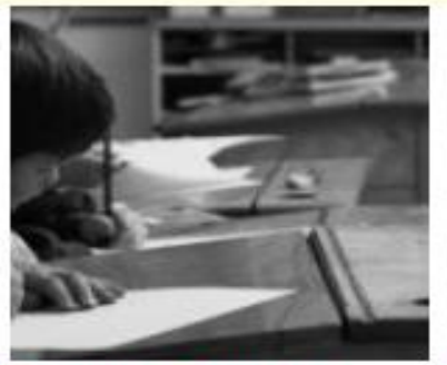
Canadian Council on Learning