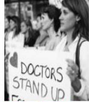
Canadian Doctors for Refugee Care