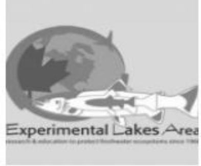
Experimental Lakes Area