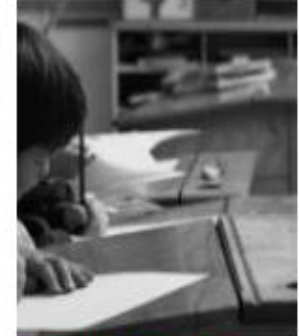
Canadian Council on Learning