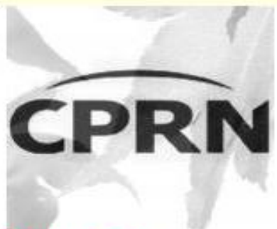
Canadian Policy Research Networks (CPRN)